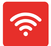
2x2 MIMO WIFI 6E